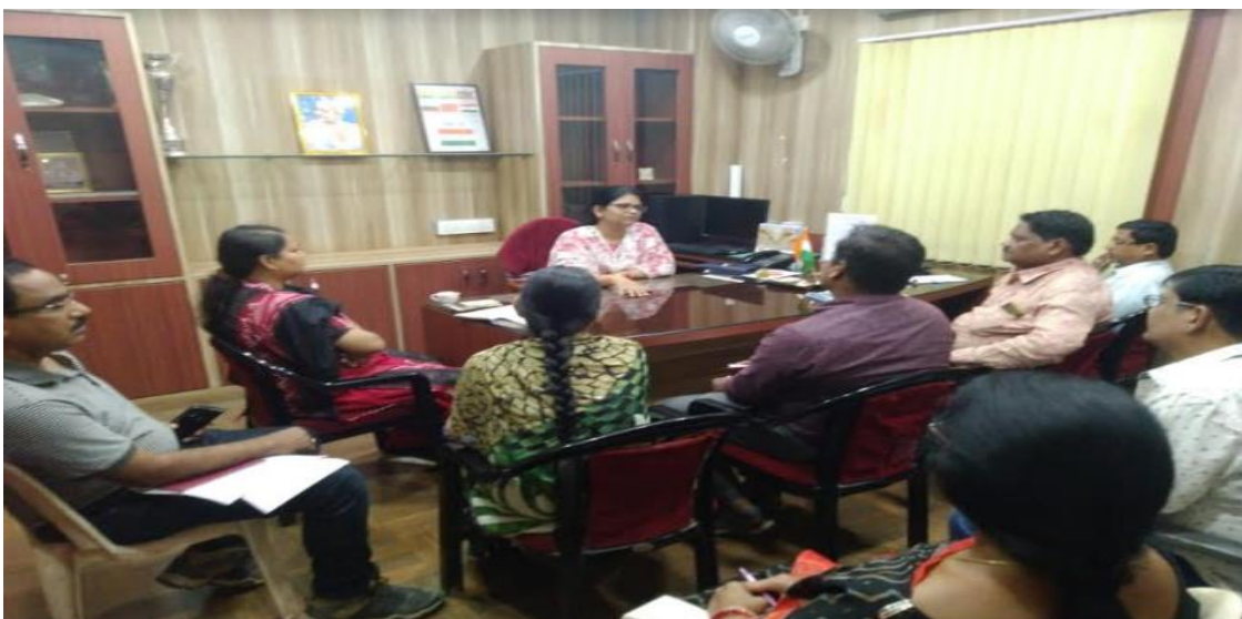
By: MRT, AMRUT, SMC