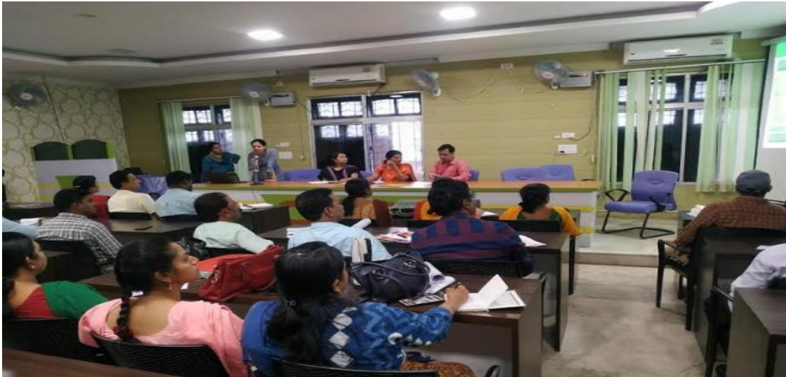
Mo sarakar meeting followed by 5T meeting which held on dtd 22.02.20 at office chamber of Commissioner, Dy commissioner and all staffs of SMC are present and attended in this meeting.