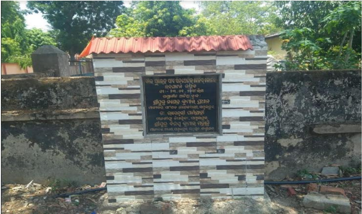
By:-MRT (AMRUT, SMC)