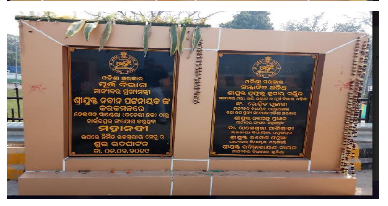
By: MRT, AMRUT, SMC