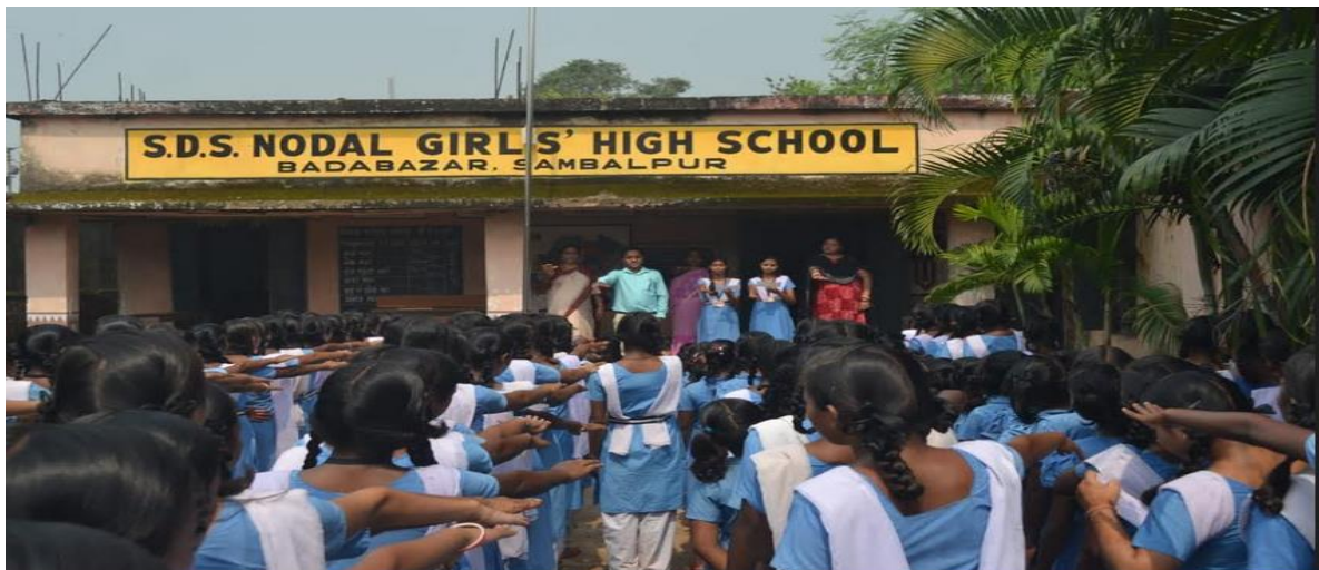
By; MRT, AMRUT, SMC