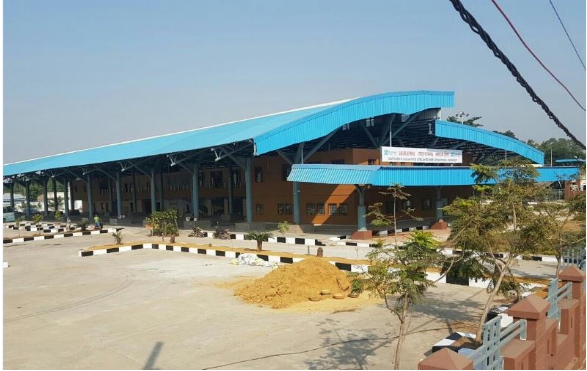
Ainthapali New Bus Terminus Ingurated by Hon'ble CM