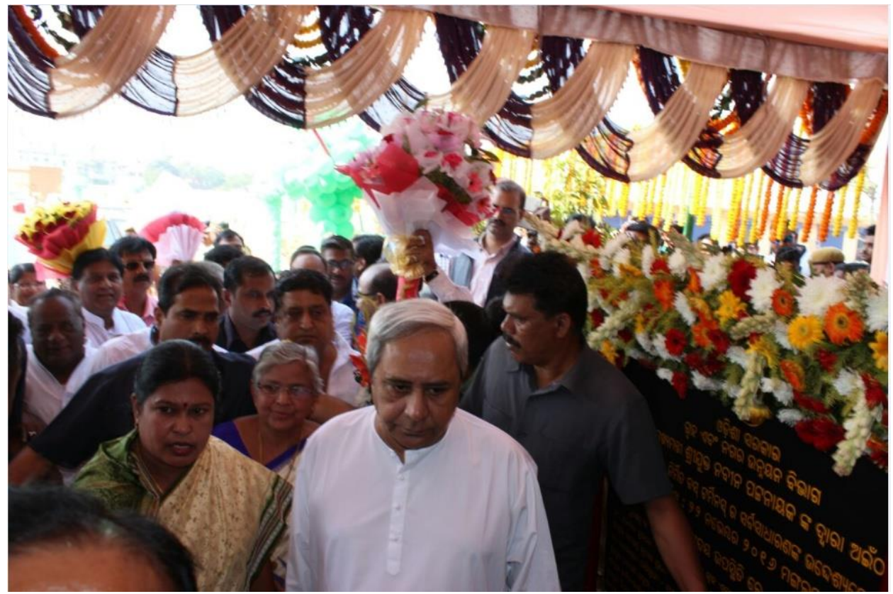
Inaguration of Ainthapali Bus stand by Hon'able Chief Minister