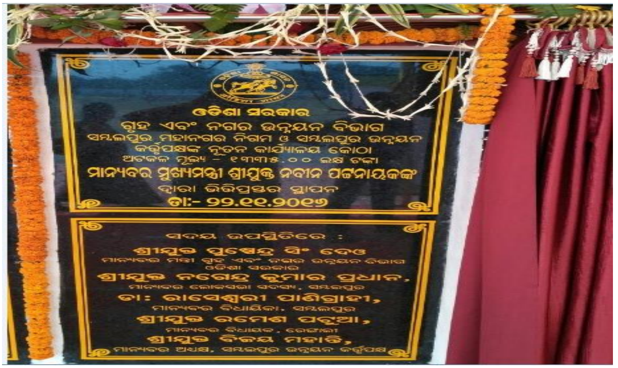
Composite New Office Building of SMC & SDA