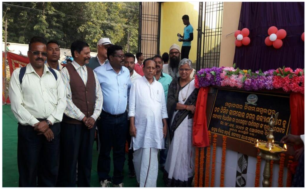
Inauguration of Bhimabhoi Nagar Kalyan Mandapny Hon'ble MLA