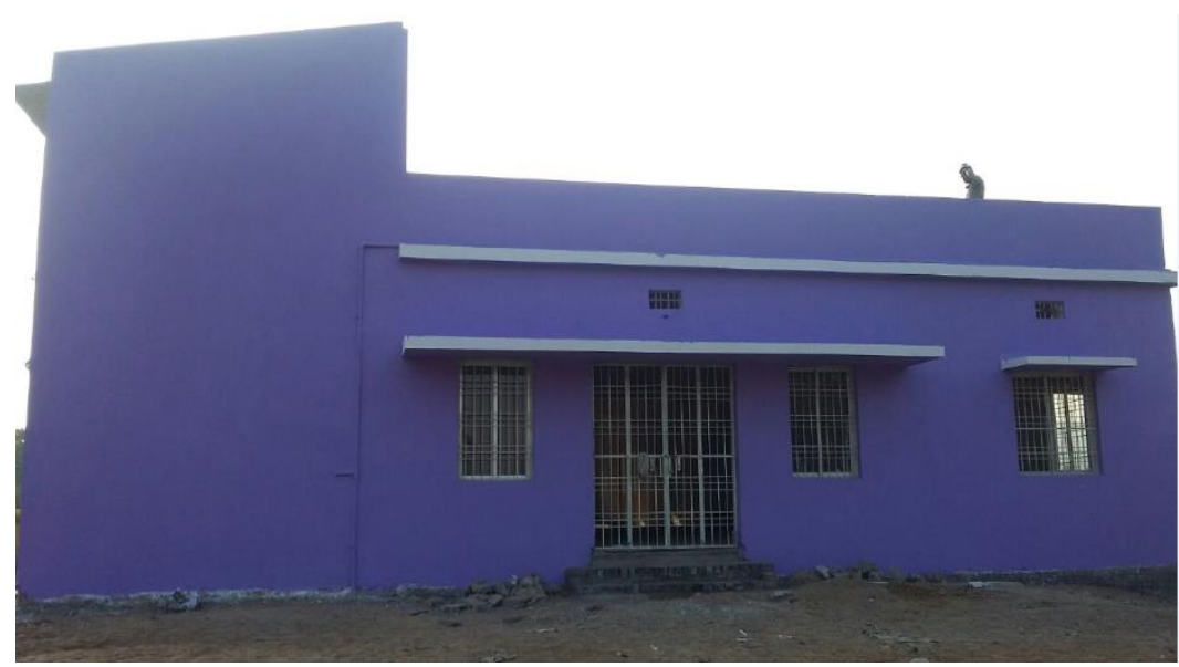
Santinagar Bhimabhoi Kalyan Mandap ingurated by Hon'ble MLA