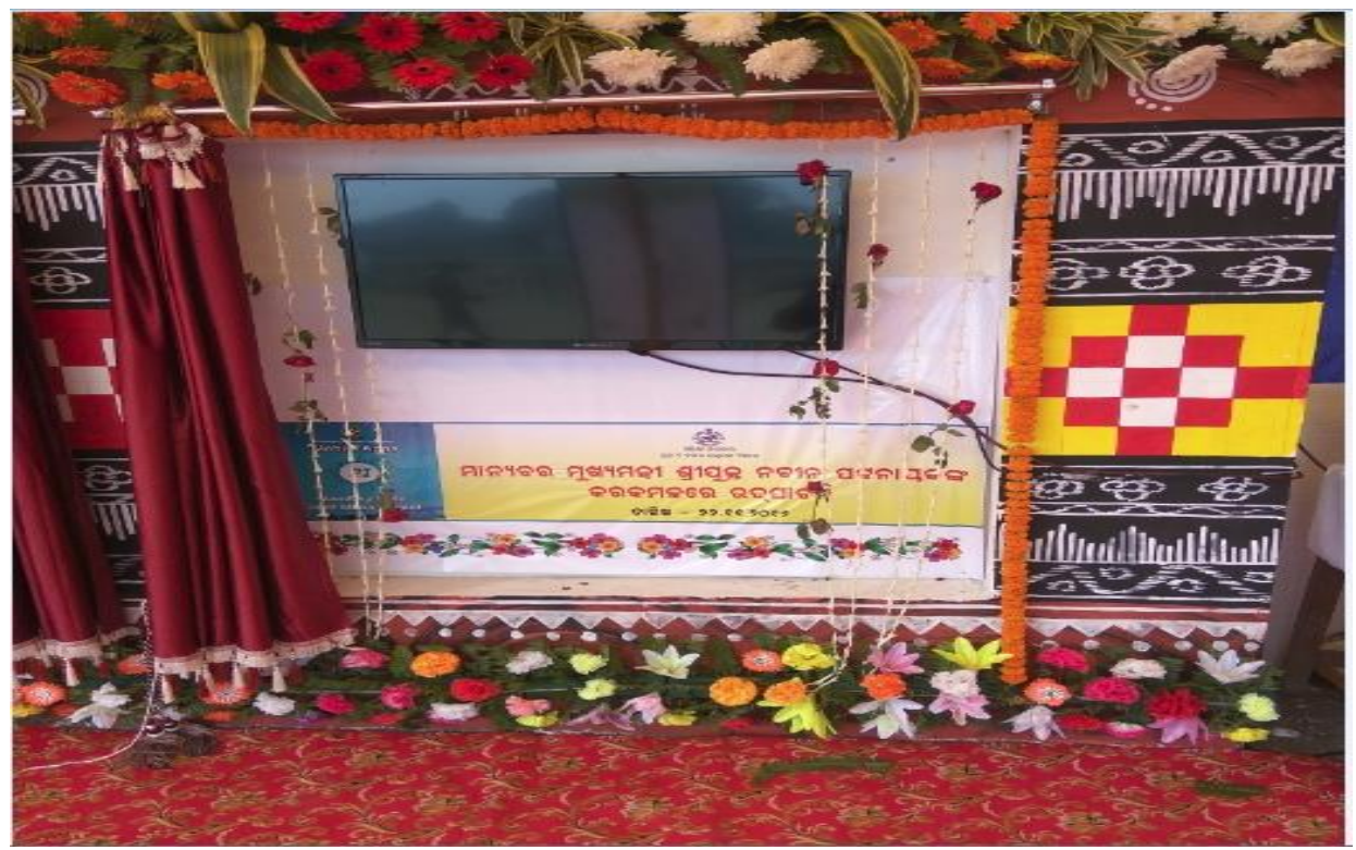
Tuesday, November 22, 2016 Mobile App for Attendance of Sanitary Field Staff