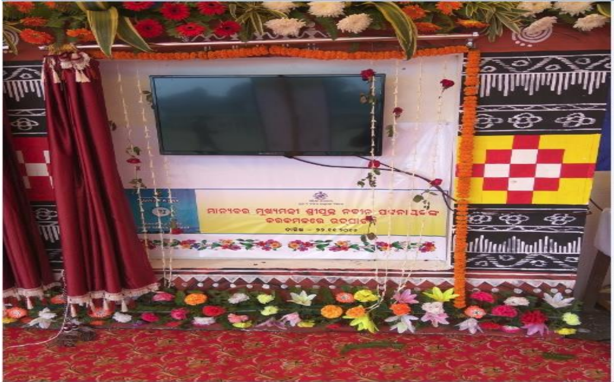
Tuesday, November 22, 2016 Mobile App for Attendance of Sanitary Field Staff