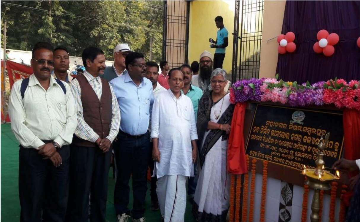
Inauguration of Bhimabhoi Nagar Kalyan Mandapny Hon'ble MLA