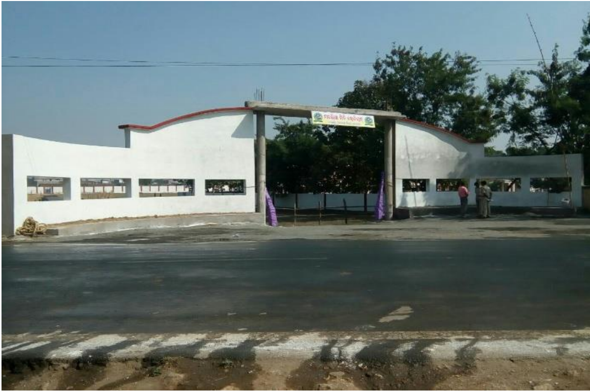
Mandalia Mini stadium