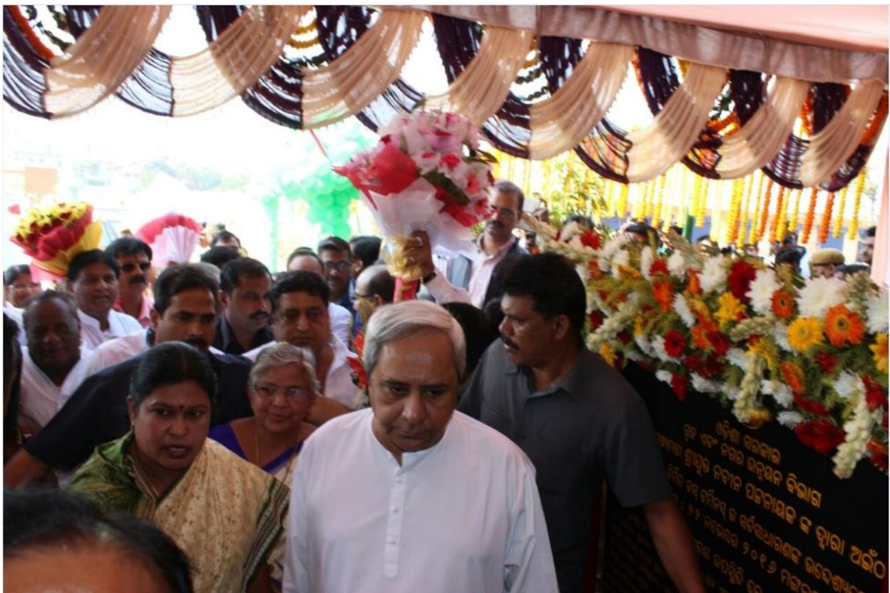
Inauguration of Ainthapali Bus stand by Hon'able Chief Minister