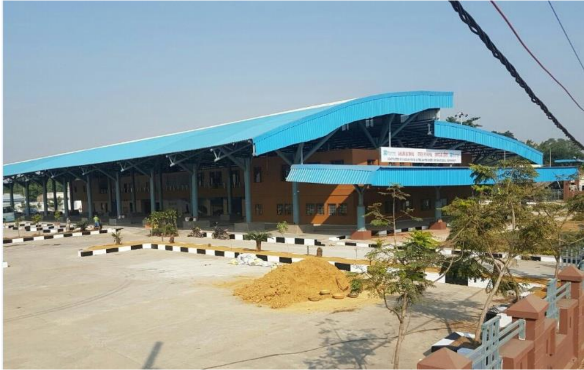
Ainthapali New Bus Terminus Inaugrated by Hon'ble CM