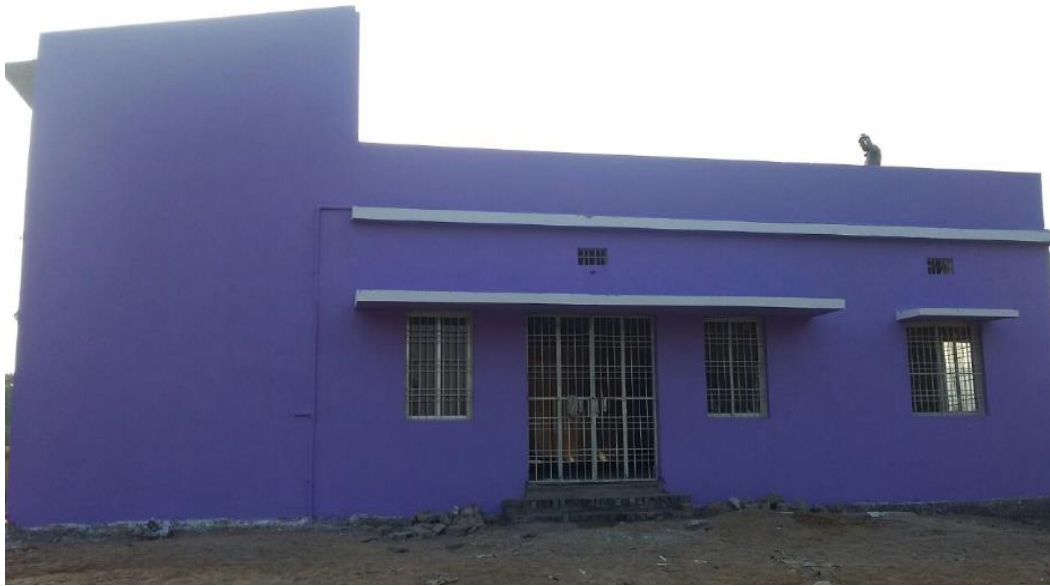
Santinagar Bhimabhoi Kalyan Mandap ingurated by Hon'ble MLA