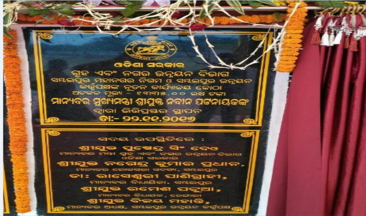
Composite New Office Building of SMC & SDA